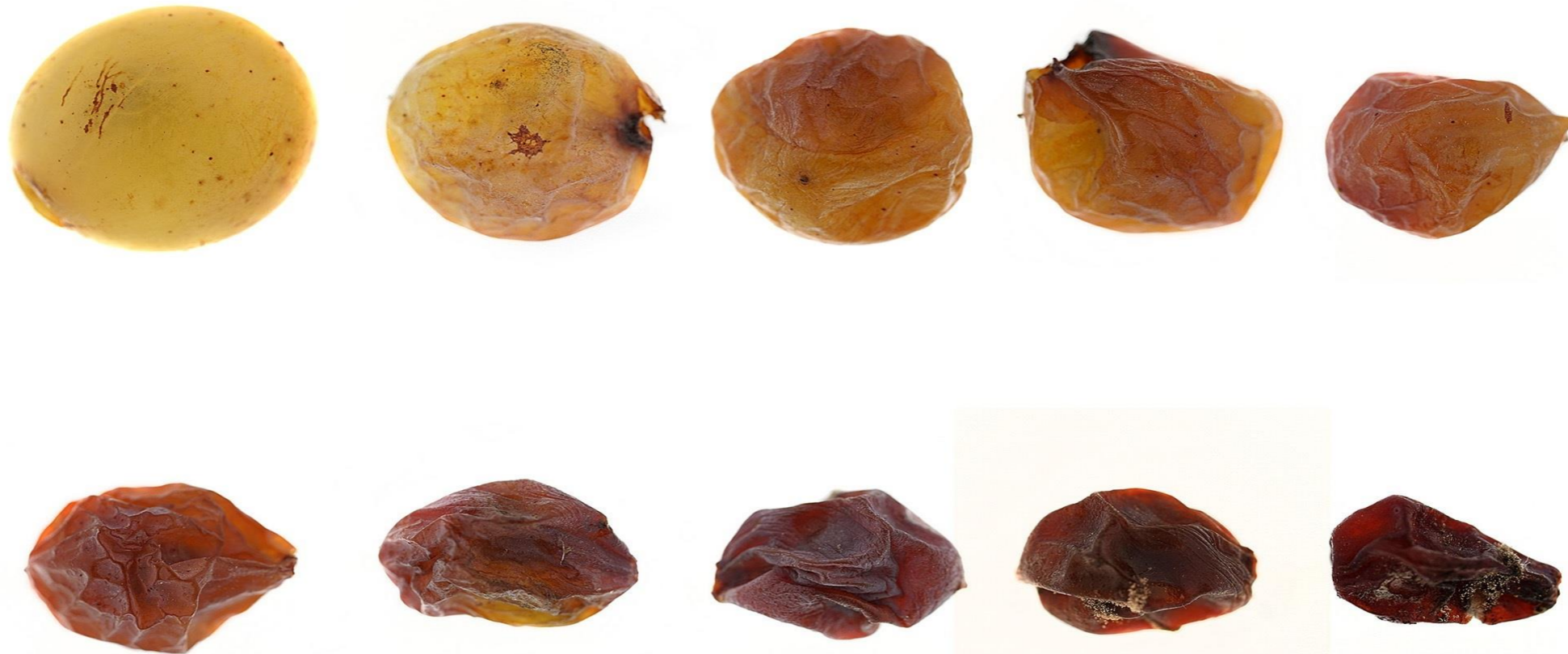
Botrytisation in Tokaj Aszú berries