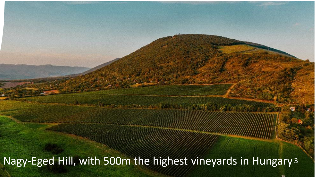
Nagy-Eged Hill, with 500m the highest vineyards in Hungary 3