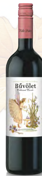
Bűvölet / Fascination

Our Cabernet Franc blend with its well defined fruity notes and rich spiciness is just like a magical melody that is enchanting.