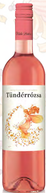
Tündérrózsza / Fairy Rose

Rich and fruity rosé of our local grape Kékfrankos. It has been kept on fine lees for months.