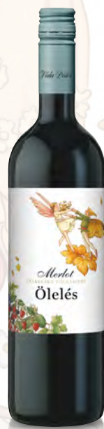
Ölelés / Embrace

With its loving character, vibrant acidity, beautiful balance, and long finish, this is a true Szekszárd Merlot.