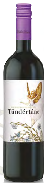
Tündértánc / Fairy Dance

We think this is how a real Szekszárd wine should be. With its charm and elegance, it's like a fairy dance. A juicy Kékfrankos from our cooler parcels blended with Merlot.